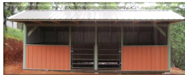
2 12x12 stalls; 6' overhang; 4' gates. $8,200 installed!