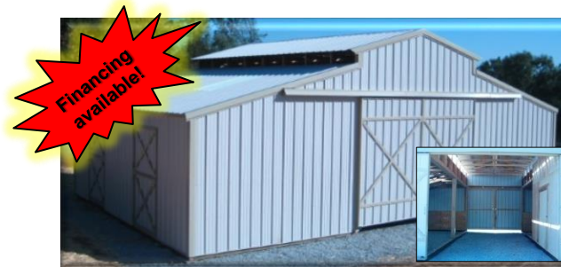
36x24 Raised-aisle barn; sliders; Dutch doors; Inset - interior of barn. $20,00 installed!