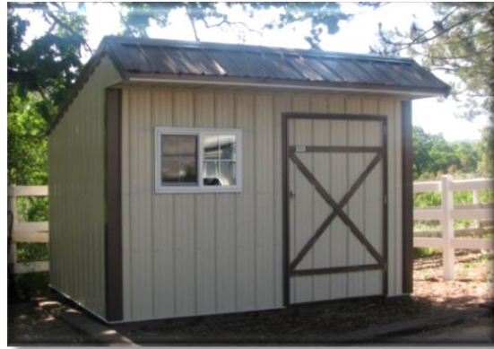
9x12 Saltbox * Window option not included