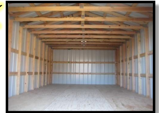
Interior of 12x20 Gable Shed with optional snow load truss