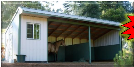
12x30 with optional stall divider and 3x3 window