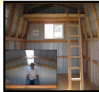
Interior of 9x12 Gambrel Barn with optional loft, ladder and window. Inset – loft in 12x