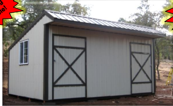
12x18 with optional 2 nd door and 3x3 window