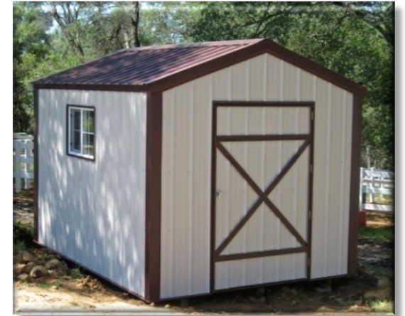
9x12 Gable Shed * Window option not included