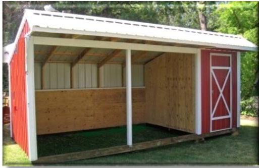
9x21 MUS * 6' storage room standard feature