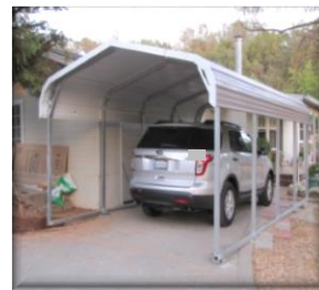
Metal buildings: Carports, RV covers, Garages