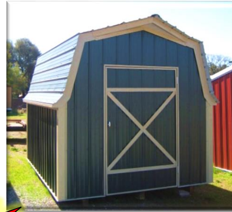
9x12 Gambrel Barn