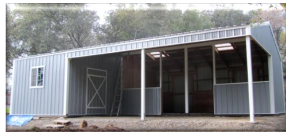
24x36 Barn (12x24 storage; 2 12x12 stalls; 12x24 overhang; stall enclosures and sliders. $20,000 installed!